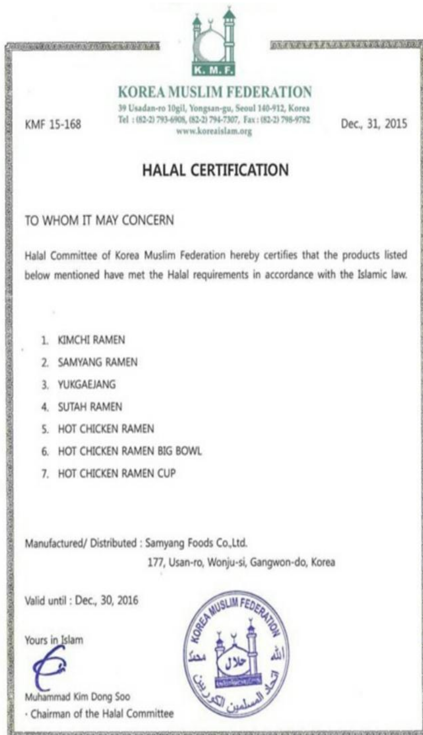
Gambar : Sertifikat Halal KMF