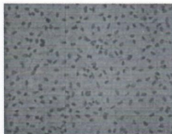
Figure 2. The positive expression of von Willebrand factor (vWF) in endothelial cells

By immunological identification using immunocytochemistry method, the EC culture positively expressed von Willebrand factor (vWF) at the cell membrane as shown in Figure 2.