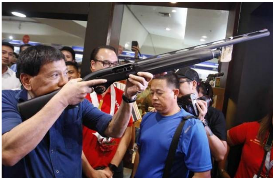
(Rodrigo Duterte berpose dengan sebuah Senjata Api)