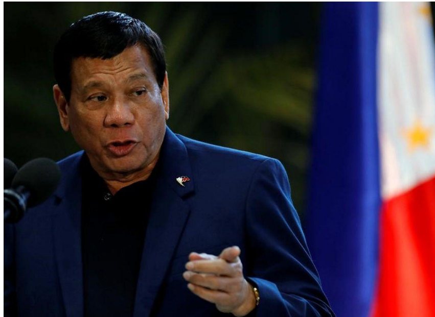
(Presiden Terpilih Filipina 2016 Rodrigo Duterte)