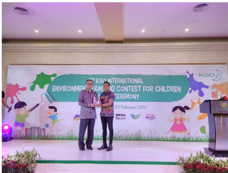
Picture 3.4 PT KAO Indonesia cooperate with YCAB

children about the importance of keeping self, and environment cleanliness and has reached 3,070 children from 20 schools in Jakarta, Cikarang and Karawang since June 2016 and the campaign is conducted in 6 months. YCAB has the same vision with PT KAO Indonesia, which is to improve the awareness about a healthy lifestyle to a younger generation. This program delivers various lessons to beneficiaries, for instance, how to do handwashing, tooth brushing, showering, and to increase awareness to love the environment (YCAB, 2017).