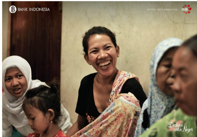
Picture 3.6 YCAB Empower the Women