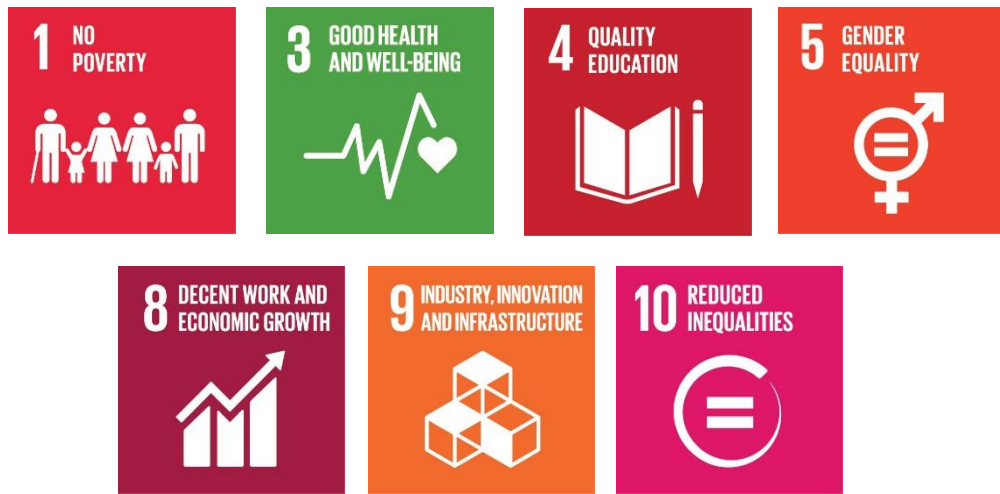
Figure 3.4 Goals of SDGs in YCAB