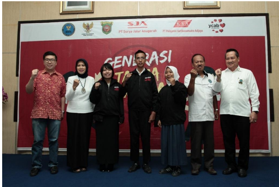
Picture 3.3 Generasi Tanpa Narkoba

Jalur Anugerah and PT Pelayaran Adijaya together with the government of Samarinda, KPAI, and BNN (YCAB, 2017).