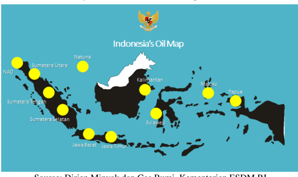
Figure 2.1. Indonesia's Oil Map<sup>15</sup>

Indonesia is very rich of its natural resources, including oil and gas. Indonesia was a net oil exporter, which means that Indonesia had oil production that exceeded the domestic needs. Today, Indonesia is still an oil producing country, but the production rate unfortunately cannot fulfill the domestic demand due to the fast industrial development. The map of Indonesia's oil can be seen in Figure 2.1.