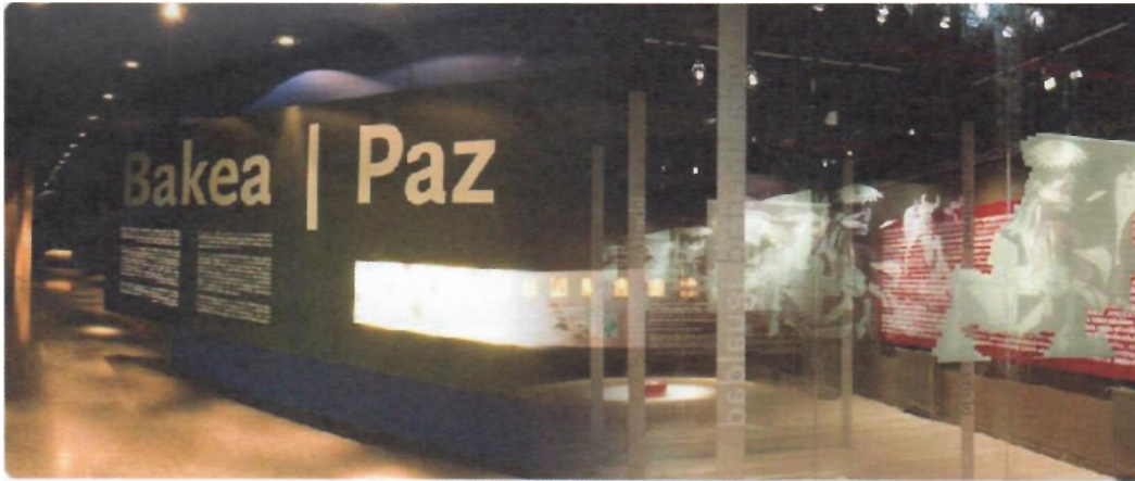
Figure 2. Peace Museum / Museo de Paz

Apart from the permanent spaces of the museum that visitors can see, they also have temporary space which is dynamically changing from time to time. In 2014 this temporary time travel from the old time of Gemika until the recent situation of Gemika. Some pictures are shown in this exhibition but in two types of pictures: the old town and the new town, the old generation picture and the young generation of Gemika, the old street and the new street of Gemika and many aspects that can be compared between the past and the present. The most interesting part on this section is the Photoshop Photos where they combine two different pictures of old and new pictures together but only different colour; for example, they showed soldiers (in black and white) standing on the street with another photo with the current condition with kids playing on the same street (in colour).