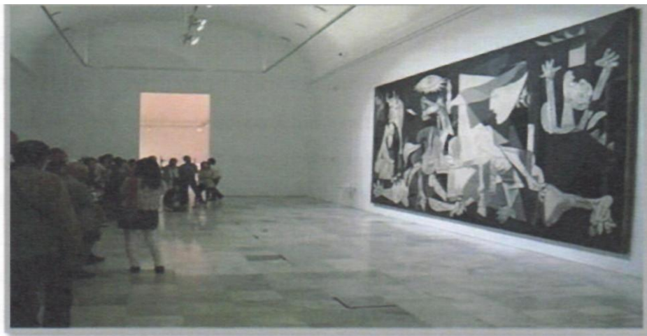
Figure 4 Guernica at Reina Sofia-Madrid (reinasofia, 2014)

Guernica. In addition, the painting of Guernica is also a transfer media of the collective memory from generation to generation through the extraordinary painting that has the power of art. Earlier we have the commemoration which functioned to transfer the collective memory through the narration of the survivors and the exact timing of the bombing, the peace museum transfers the collective memory through the objects from the bombing that were collected as a silent witness, peace research centre of Gernika Gogoratu : is transferring the collective memory through the education and scientific approach and finally the painting of Guernica is presented to transfer the collective memory through the power of the art and the international recognition. However, the whole elements were predominantly taking the sorrow as medias to keep peace.