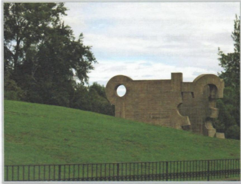
Figure 7 Gure Airaren Etxea by Eduardo Chillida (Mammoudouy, 2014)