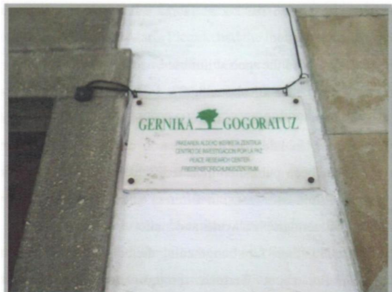
Figure 3 Gernika Gogoratu; Peace Research Centre (Personal Documentation)

its foundation is dedicated for the human tragedy that happened in Gernika in 1937 or during the Spanish civil war. The centre was established in 1987 coincided with the 50th anniversary of the Gernika bombing through the unanimous decision of Basque parliament. The establishment of the centre was also in the same time as the first apology from the Germany, represented by the parliament member of the green party Petra K Kelly which later the apology was also made by the Germany President, Roman Herzog in 1998.