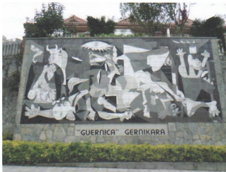
Figure 5 copy of Guernica painting in Gernika (Per onal doc.)