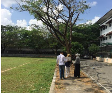
Proses pengambilan data di lapangan