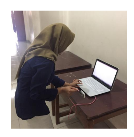
Proses pengambilan data dalam gedung