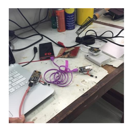
Uji coba alat