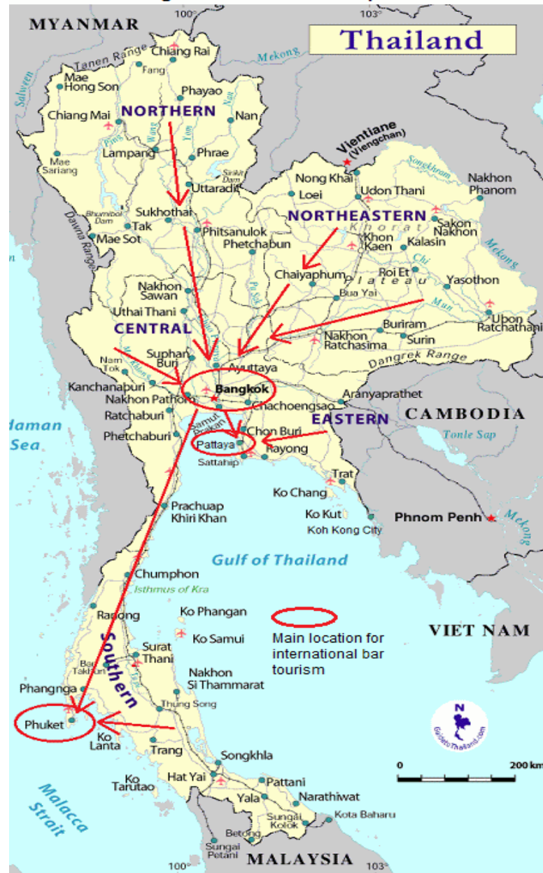
Map of Thailand indicating how girls and young women "go south" for work and prostitution