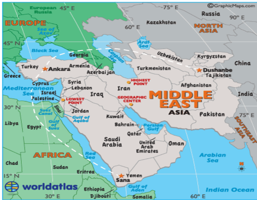
The Map of Middle East