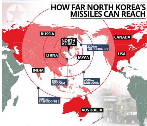
Figure 4. 2 Distances of North Korea's Missile Arsenal

Source : BBC News, What we know about North Korea's missile programme, 10 August 2017