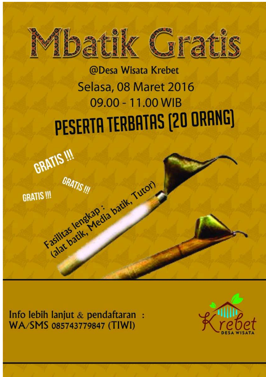
Gambar 3.6. Poster Desa Wisata Kreet