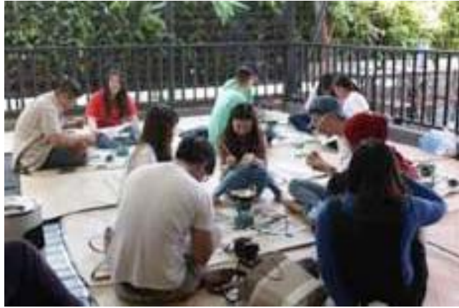
Workshop Batik Kayu: menggambar sketsa