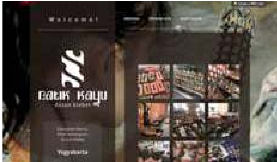
Tampilan Website Desa Wisata Kreet