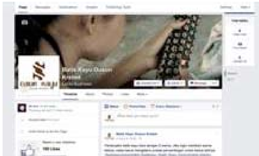
Facebook Batik Kayu Desa Wisata Kreet Page