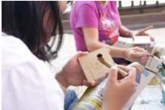
Workshop Batik Kayu: mencanting