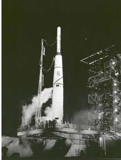
Figure 2.2 The Launch of Explorer 1 in 1958 4

The competition between the U.S. and Soviet Union was not only affecting both states but also the international arena. The attempt of the U.S. to contain communism from spreading was not limited to its soil but also to the West and the East. Both the U.S. and Soviet Union were intervening in many events of conflict such as Korean War, Vietnam War, and the Bay of Pigs invasion, which made the relation between the U.S. and Soviet Union become critical. Fortunately, the Cold War ended in following of the collapse of Soviet Union in 1991. Many of the states of Soviet Union declared their sovereignty. The Cold War was officially ended in a summit