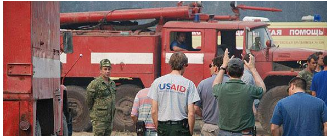
Figure 2.6 USAID in Russia 8

However, by 2012, USAID has ended its programs due to the expulsion by the Russian government. The government of Russia concerned, that any NGOs with foreign funding will harm the political atmosphere in Russia, especially USAID whom for two decades has been giving aid to Russia to support democracy, protect human rights, and promote fair elections. This statement was of course disappointing to the U.S. Government since USAID has been working in Russia since 2002 and had budgeted almost $50 million for its programs in Russia, and it has been helping in maintaining U.S.-Russia relations. (The Washington Post, 2012) The expel of USAID has proven that U.S. foreign policy on maintaining relationship with Russia was having deterioration. Although the USAID office in Russia is closed, the government of the U.S. will continue its work through some organizations and as an action to maintain its relationship with Russia, the U.S.