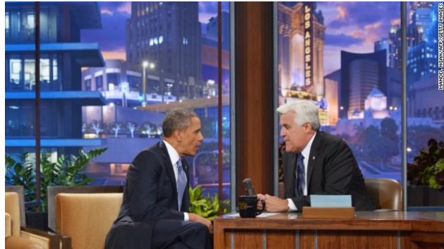
Figure 2.7 Obama in The Tonight Show with Jay Leno 10

“...when it comes to universal rights, when it comes to people’s basic freedoms, that whether you are discriminating on the basis of race, religion, gender, or sexual orientation, you are violating the basic morality that I think should transcend every country.”