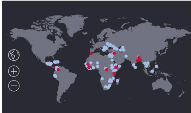
Figure 2.5 Interactive Map of USAID around the world. 7

USAID has operated and spreaded its wings in many foreign countries and regions, such as Afghanistan and Pakistan, Africa, Asia, Europe and Eurasia, Latin America and the Carribean, and the Middle East.