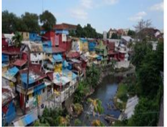
Public houses along the Sungai Code bank occupy the green and protected areas.