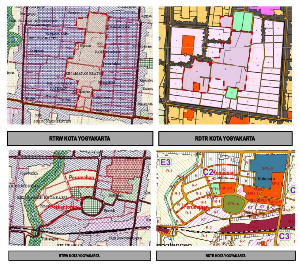
Figure No. 1 the difference substation of space utilization directions between RTRW and RDTR Yogyakarta City