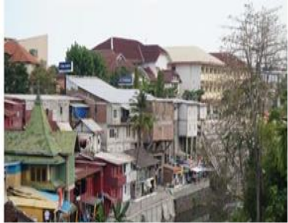
The real condition of public houses along the Sungai Code bank