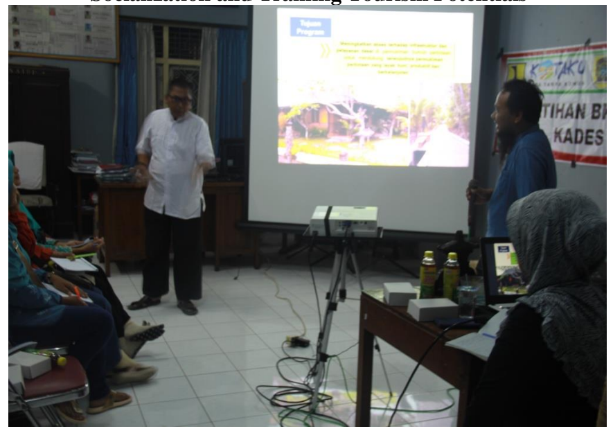
Figure 3.1 Socialization and Training Tourism Potentials

From the explanation above, it can be concluded that the initial conditions for collaboration between village government and Java Reconstruction Fund are from the community and village government who innovate to make Candirejo village a tourist village which can later improve the economy in Candirejo Village.