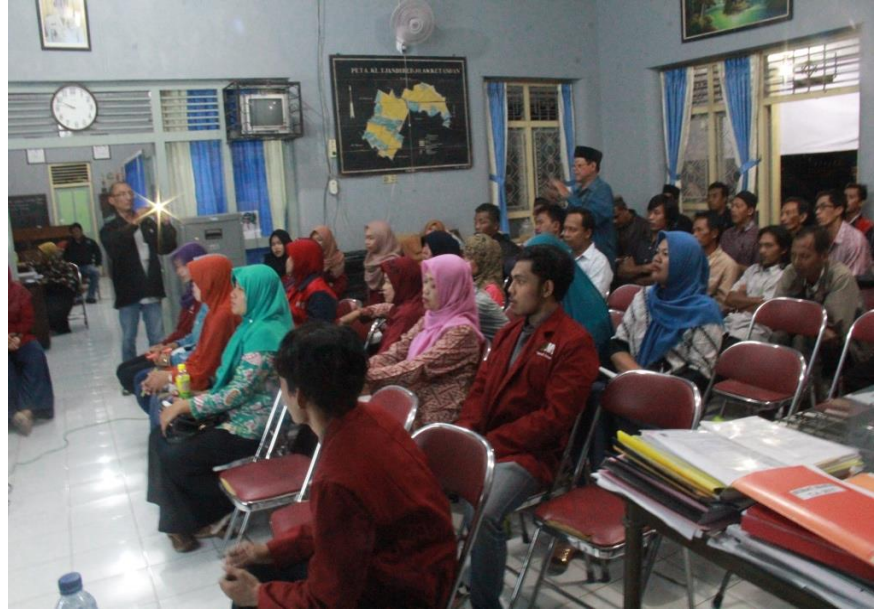
Figure 3.2 Socialization and Training Tourism Potentials