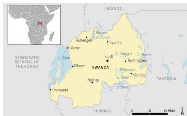
Figure 3. Rwanda's Bordering Countries