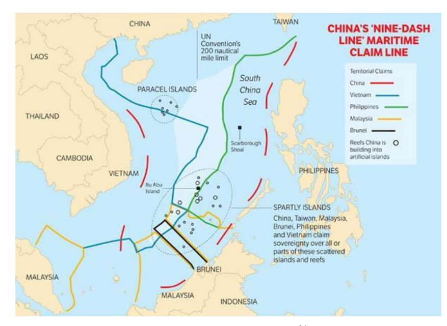
Figure 2.1 Map of Nine-Dash Line<sup>34</sup>

Since the declaration of nine-dash line by China, there are areas that in dispute due to its collide with Southeast Asian countries' maritime border.