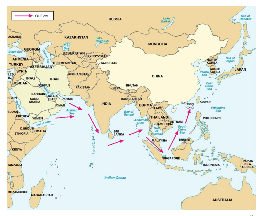
Figure 2.3 Oil flow map from Middle East through the Straits of Malacca<sup>62</sup>

Besides that, China has assisted Burma with 200 million US dollar loan during the US sanction in 2003 as the consequence of the human rights violation. While in 2005, to improve their bilateral ties especially on its trade and military cooperation, China and Burma agreed to increase their trade value from approximately 1 billion US dollar to 1.5 billion US dollar in 2005.<sup>63</sup>