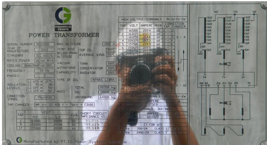
Spesifikasi Transformator 2