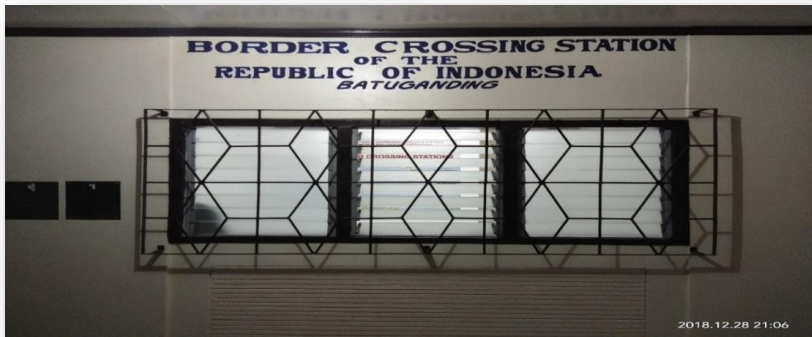
Figure 3.6 Border Crossing Station of The Republic Of Indonesia in Batuganding, Balut Island)