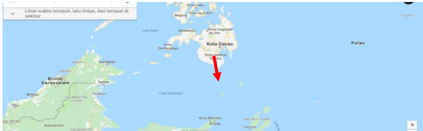
Figure 3.8 The Route from Glan to Batuganding Border Station and to Sangir Island by Pump Boat