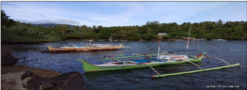
Figure 3.7 The Image of Pump Boat