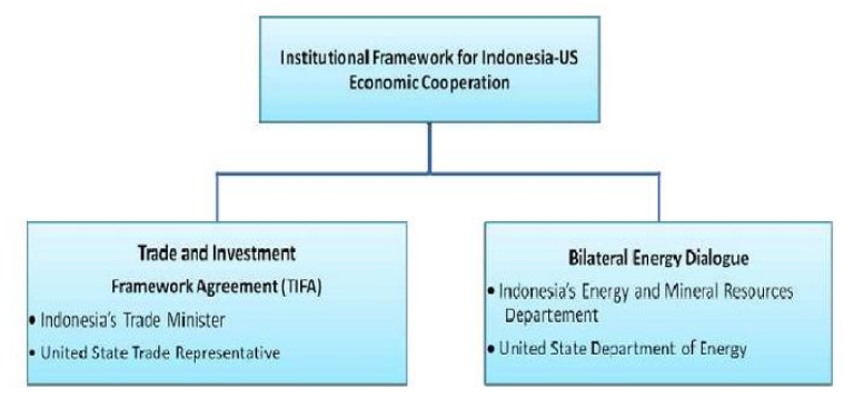
Figure 2. The Framework of Indonesia and America Economic Cooperation

tend to increase from year to year. The country of destination of exports of industrial products is the United States