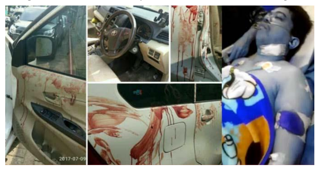
Figure 21. Attack on Hermansyah of ITB's Telecommunication Expert