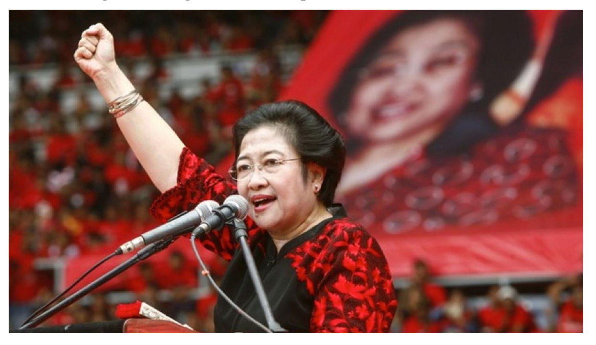
Figure 15. Megawati Soekarnoputri of the 5th President