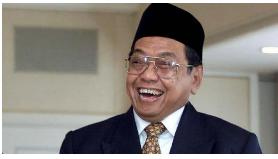
Figure 14. Abdurrahman Wahid or Gus Dur

rights in transition period. This Law, which still exists until now, guarantees and protect human rights way better than before it was created. Under the Human Rights Law 1999, the Article 23 (2) gives a broad enjoyment to the freedom of expression. Habibie later passed the first amendment of the 1945 Constitution in 1999 which the changes were focused on the legislative and executive Articles. There were not many important events happened during Habibie's rule. His short period was ended in 20th of October 1999 and was succeeded by Abdurrahman Wahid who colloquially known as Gus Dur.