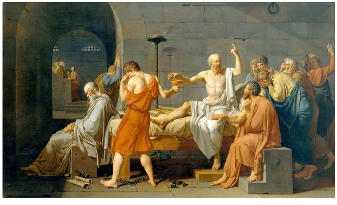
Figure 1. The Trial of Socrates in 399 BC

Plato's Apology , <sup>10</sup> Socrates has won the people's heart. In histories of western philosophy, the execution of Socrates is represented as judicial murder where the Athenians attempted to stifle their conscience voice by terminating the cleverest and noblest. <sup>11</sup>