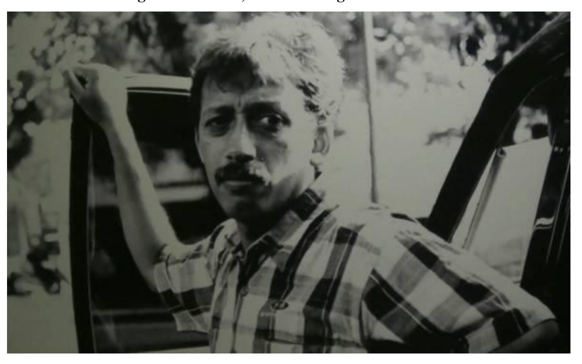
Figure 16. Munir, A Human Rights Activist