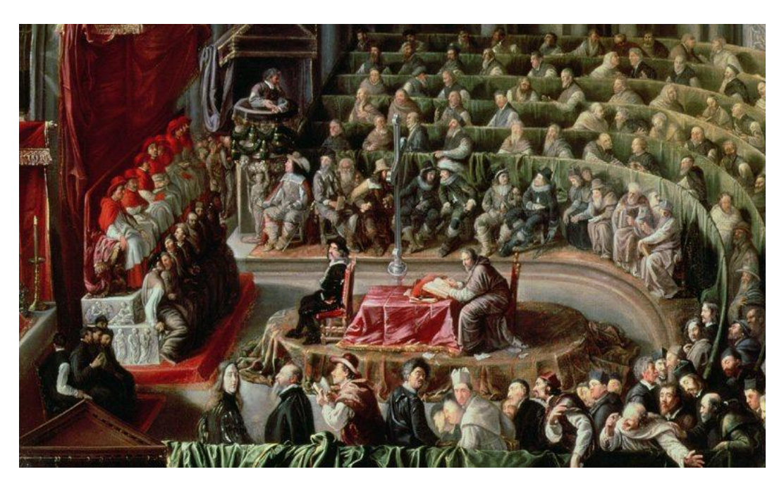
Figure 5. The Trial of Galileo Galilei in 1615