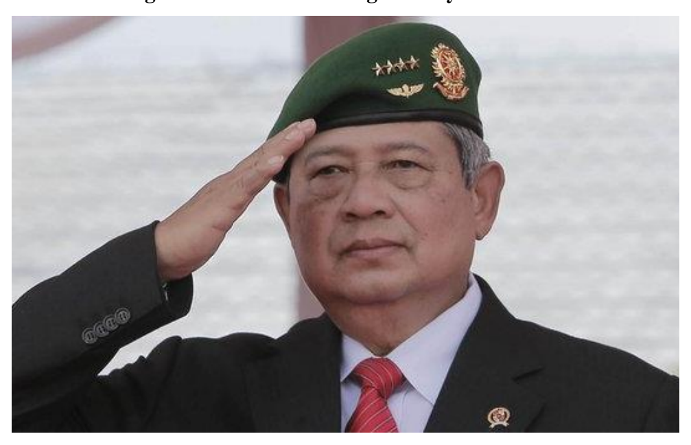
Figure 17. Susilo Bambang Yudhoyono or SBY