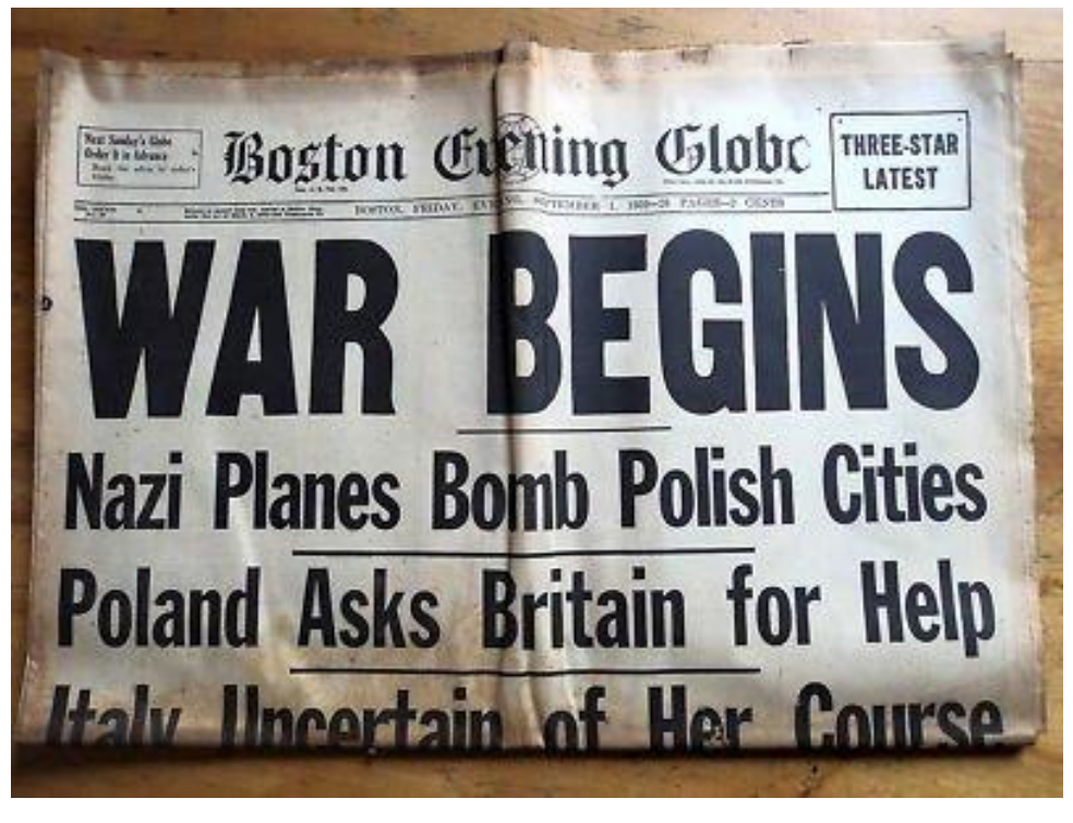
Figure 7. The Outbreak of World War II

learning liberal arts spread-out all-over Canada ever since. However, the enforcement of this freedom was in danger again thereafter.