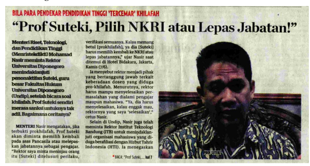
Figure 22. Suteki's Controversial Case on Academic Freedom