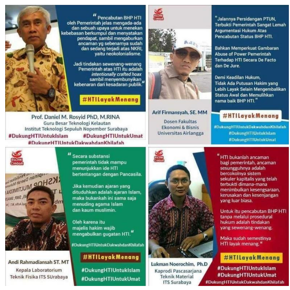
Figure 23. Surabaya's Scholars Controversy Statuses on HTI

Source: <a href="https://news.detik.com/berita-jawa-timur/d-4010598/viral-4-dosen-di-surabaya-tolak-pembubaran-hti">https://news.detik.com/berita-jawa-timur/d-4010598/viral-4-dosen-di-surabaya-tolak-pembubaran-hti</a>