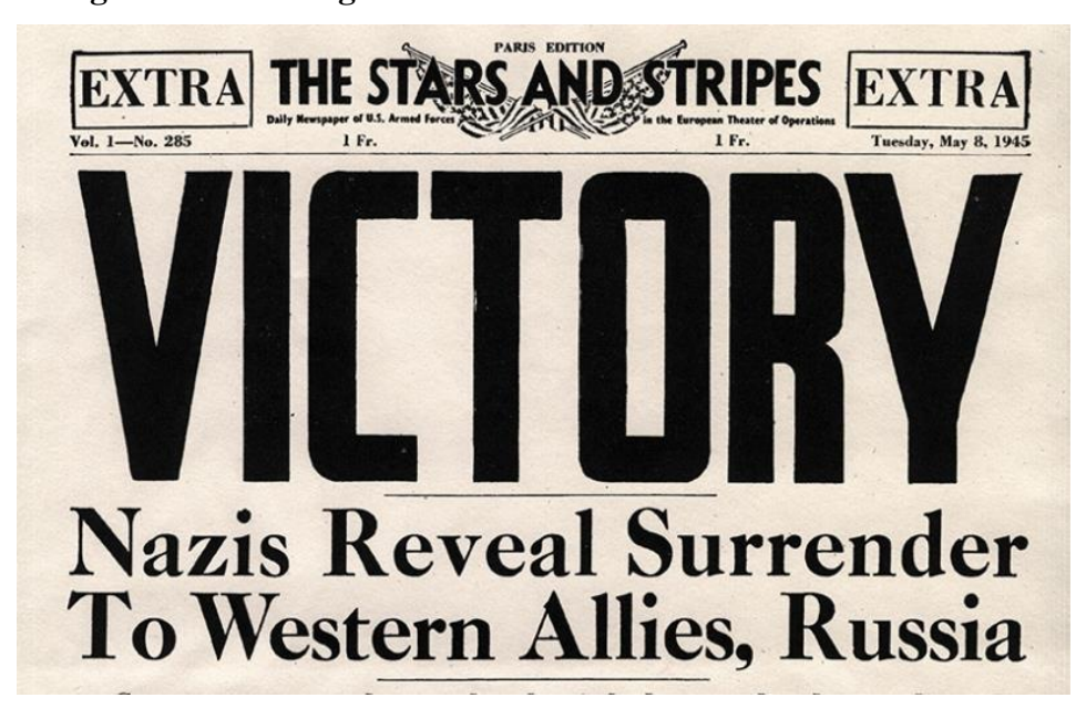
Figure 8. Front Page from the Lines of the End of World War II

The death of Hitler marked the end of the WW II on 1945. Hitler decided to commit suicide by shooting his head with a gun on 30<sup>th</sup> of April 1945 in his bunker (German: Führerbunker ). 124 Without Hitler as the leader, Germany lost its important pion and was on the verge of collapse from the War to the Allies. 125 Later, the news spread out all over the world and begun to repair the world from the destructions after the War. One major important event that happen after the end of the WW II was the declaration of Universal Declaration of Human Rights (UDHR) on by the UN. 126 It remarked the beginning of the new era for human rights in the world.