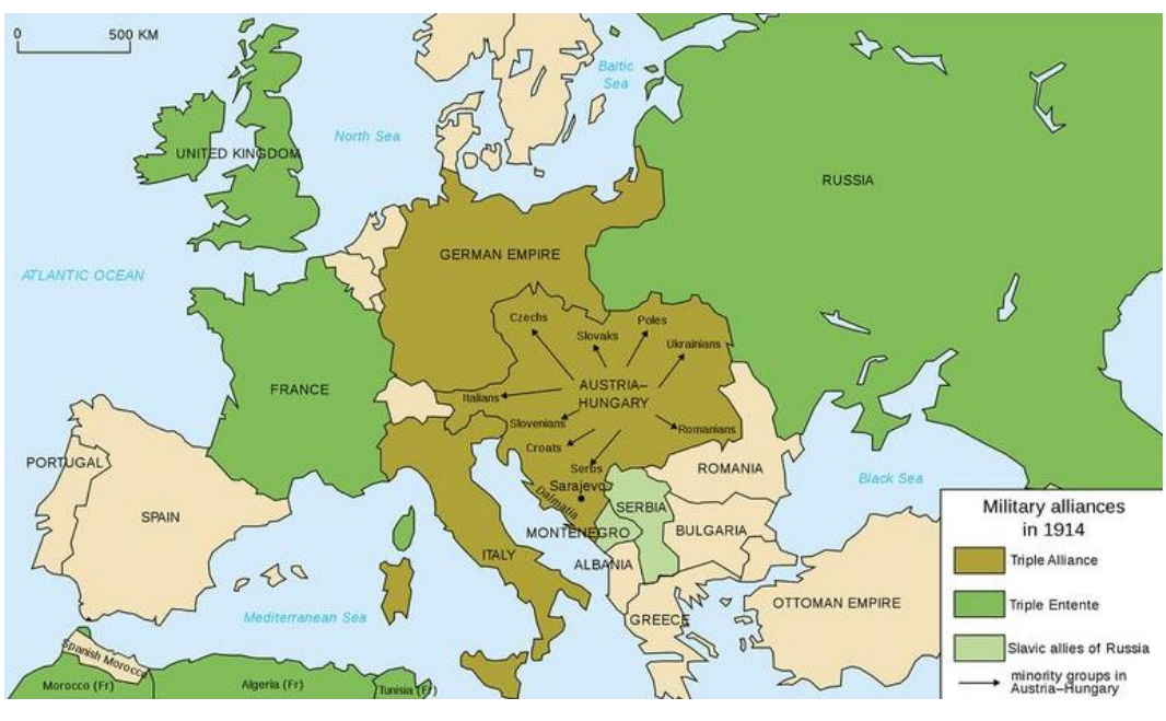
Figure 6. The Major Alliances of World War I

neutral until Germany warship sunk the American's and killed its civilians, by that causality, USA entered the war and joined the Entente.