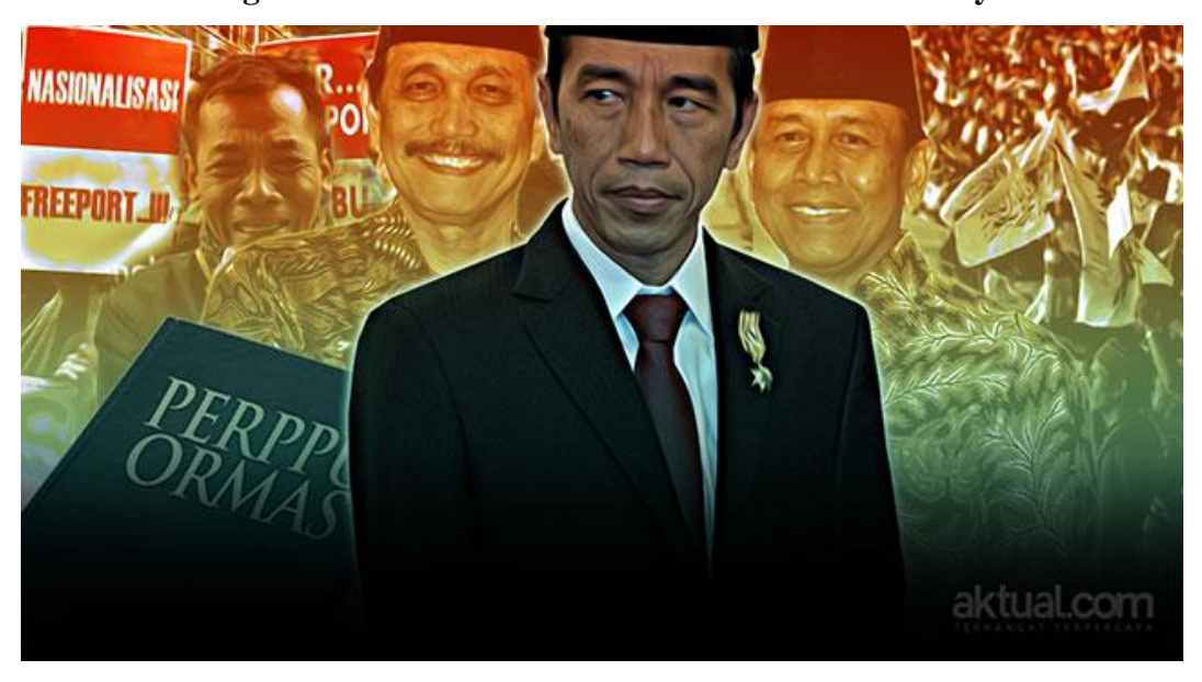
Figure 20. Jokowi and PERPPU Ormas Controversy