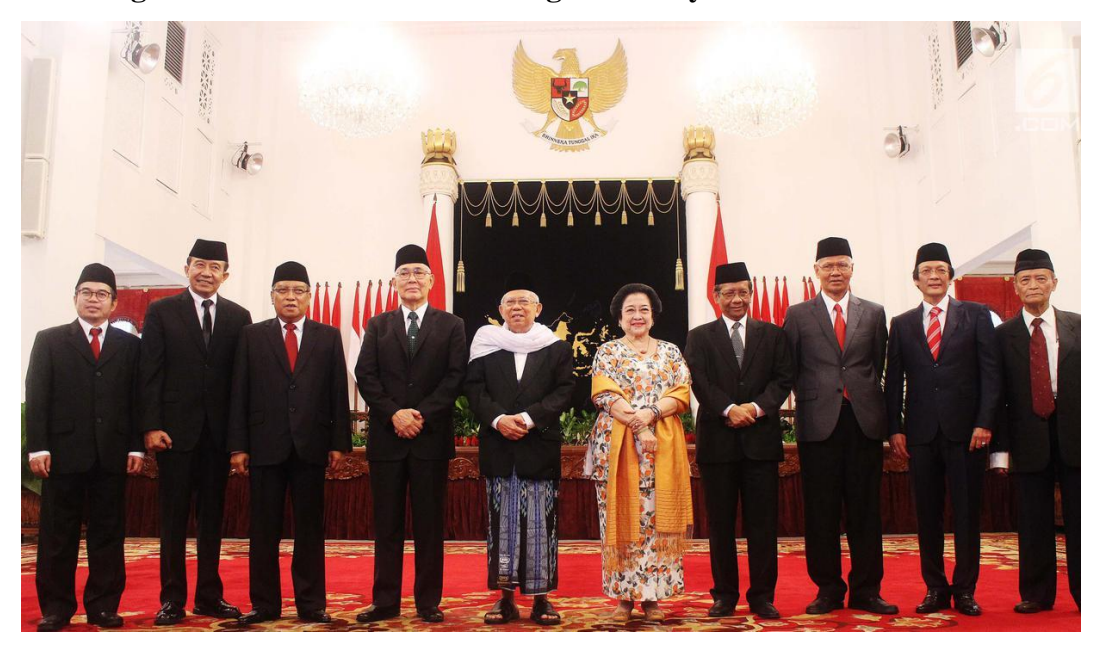
Figure 25. BPIP Structures Inauguration by the President Jokowi