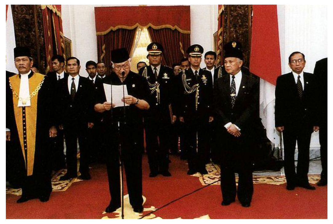
Figure 12. Resignation of Soeharto on 21st of May 1998