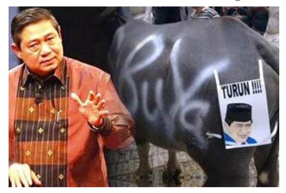
Figure 18. A Cow with "SiBuYa" Word to Mock SBY during Demonstration