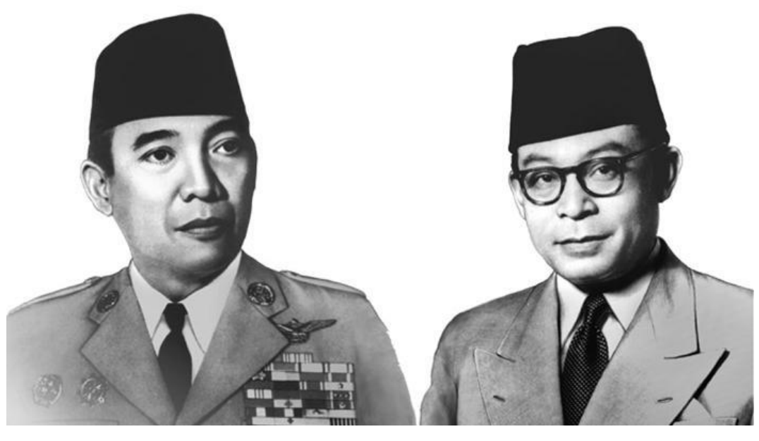
Figure 10. Ir. Soekarno and Drs. Mohamad Hatta

by the PPKI meetings one day after the independence of Indonesia which was pronounced the proclamation by Soekarno and Hatta on 17<sup>th</sup> of August 1945 in Jakarta. The PPKI meeting resulted to the promotion of Soekarno as the first President and Hatta as the first Vice President of Indonesia. Besides the promotion, the meeting also declared the first Constitution of Indonesia called the 1945 Constitution of Indonesia or Undang-Undang Dasar 1945 (UUD 1945). 142