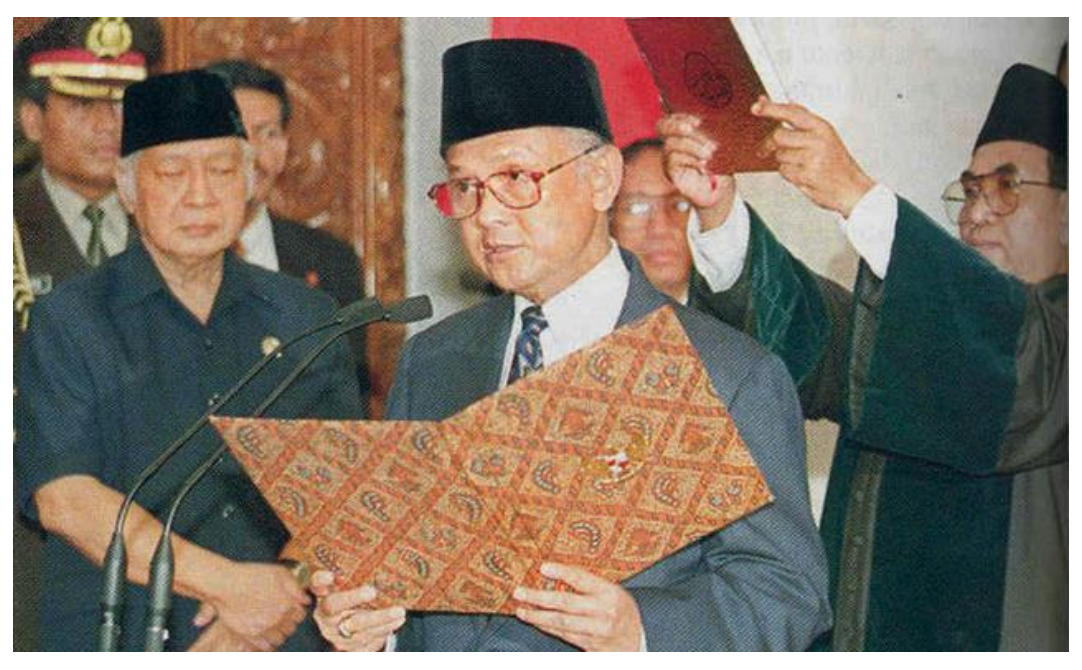
Figure 13. Habibie Sworn-In as the Third President

the people by lifting restriction on political parties and dissolving the Ministry of Information that was responsible for the censorship.