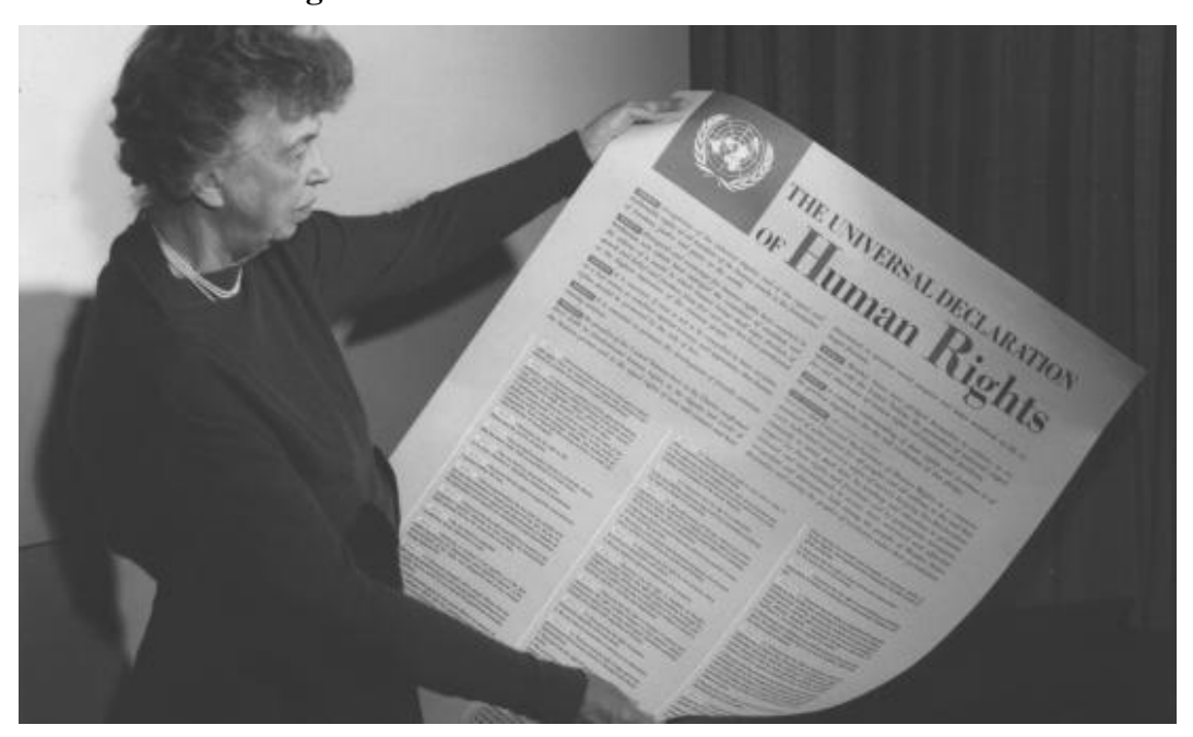
Figure 9. Eleanor Roosevelt and the UDHR