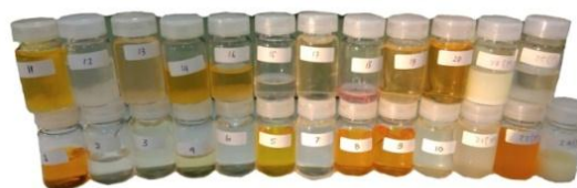
Sampel yang akan di analisis