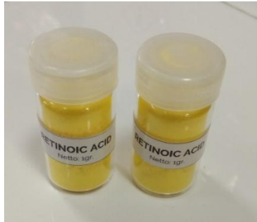
Sediaan Asam Retinoat