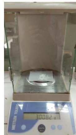
Penimbangan Sampel krim malam