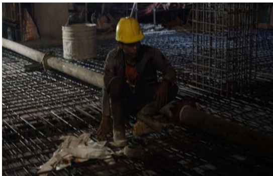
Gambar 3 Pekerja Proyek