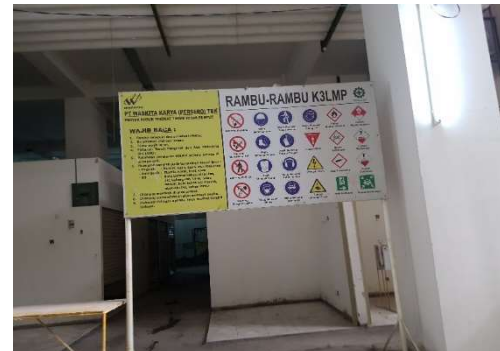
Gambar 4 Rambu-rambu K3