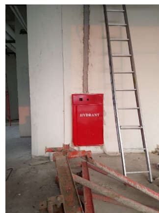
Gambar 6 Hydrant