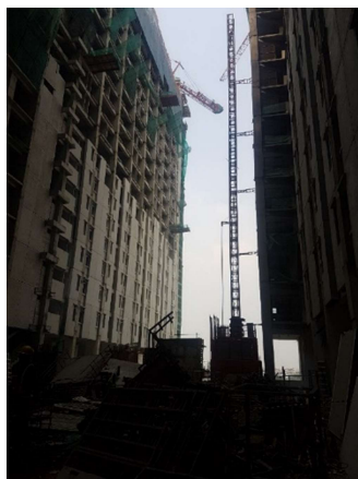
Gambar 5 Objek Penelitian