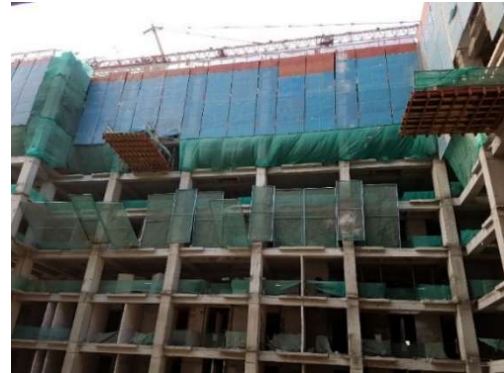
Gambar 2 Objek Penelitian