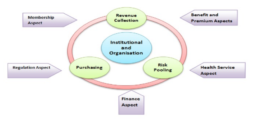
Figure 1: Health Security Implementation Aspects

According to Norman et.al (2009) in Mundiharno (2012. p. 213), it is important to consider three important things in the implementation of health security. Those are: (a) how the fund is raised; (b) how risks guaranteed together; (c) how the fund rose is used as efficient and effective as possible.