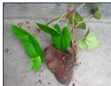
Figure I. Purple Yam ( Dioscorea alata L)

Dioscorea alata L. has a high potency because of good nutritional content, good for diabetics because it is tasteless, good for gluten allergy sufferers, and contains natural purple dye. It is also used to make processed products of noodles, cakes, bread, ice cream and jam. Its nutrition contents are 89.73% water, 0.62% ash, 0,55% acid unsaturated-ash, 0,67% fiber content, 10,93% starch, 0,82% fat, and 1.36% protein. 19