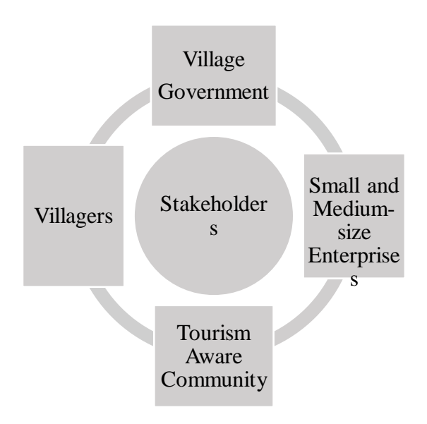
Chart 3.1: Stakeholders of Ngeposari village development

In the development of tourism potency in Ngeposari village the party which act as stakeholders consists of four parties which they are the village government, the villagers, SME industry owners, and pokdarwis community Sedyo Makmur. In this research the researcher collecting the data by interviews. Participants in this research are the four stakeholders in the development of tourism potency in Ngeposari village. The participants who had been interviewed are selected by the researcher before the interview. Participants who have been interviewed by researchers are the head of Ngeposari village, the villager, owner of one of SME in Ngeposari village, and the leader of Sedyo Makmur community.