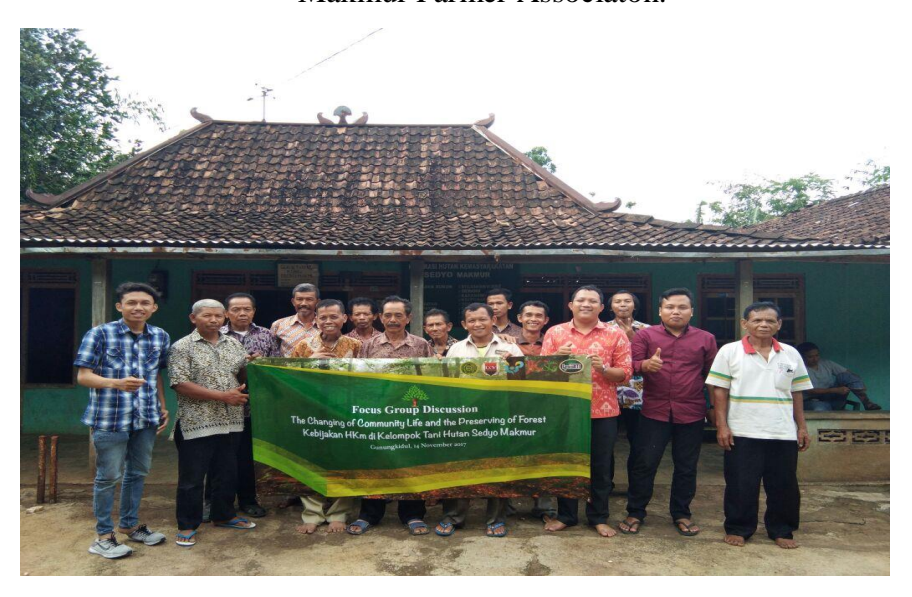
Picture 3.13: Focus Group Discussion, Igov UMY with Sedyo Makmur Farmer Associaton.