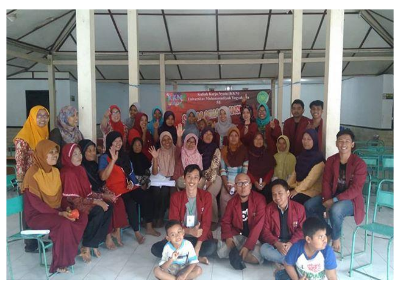
Picture 3.10: Universitas Muhammadiyah Yogyakarta Social Service Community

Factors that supported the villagers to participate in the village development were the village government. Support such as socialization and facility are provided by the village government in order to support the efforts of the villagers' participations. The roles of the village government as a supporting factor was efforts for preparing the villagers when Ngeposari village was ready to become tourism village and to accept the tourists. Furthermore, the other support obtained by the villagers was from college students from several universities in Yogyakarta through the social service community program. The presence of the college students' participation in Ngeposari village was because the village government of Ngeposari received and had agreements with related universities that undertook the program of social service community which it happened in every two times a year.