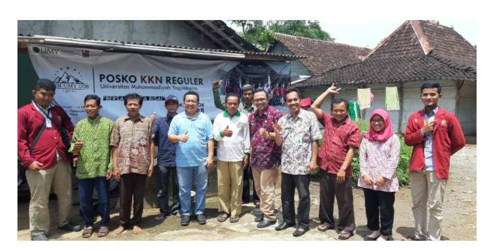
Picture 3.14: Tourism department and UMY student survey of new tourism potency in Jragum hamlet