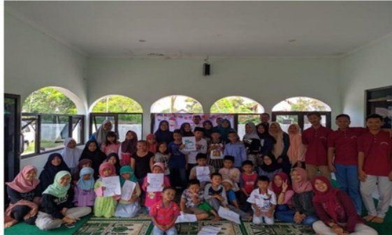
Fig. 4.2019 Ramadhan Festival

The Mubaligh Hijrah Community Service Program in collaboration with the Raudhatul Jannah Mosque Teenagers of Dusun Pojok held the 2019 Ramadhan Festival Contest which took place on Sunday, May 26, 2019 at the Raudhatul Jannah Mosque in show picture 4. This activity was attended by approximately 40 participants, the majority of them was kindergarten, TPA and Junior High School students of Dusun Pojok and surrounding areas.