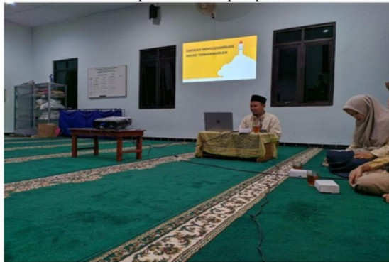
Fig. 2. Mosque Management Education

Management means the art of organizing and implementing in show picture 2. Management is also defined as an effort to plan, coordinate, organize and control resources to achieve goals efficiently and effectively. Effective means to achieve goals according to the plan and efficient means to carry out work properly and organized. So, mosque management is planning, coordinating, organizing, and controlling the resources of the mosque to make it prosperous.