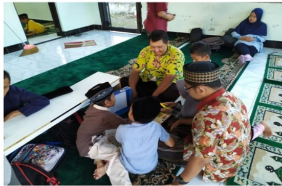
Fig. 3. Introduction to Robotic Technology

Today's society thinks that a robot is shaped like humans both functions and ways of acting in show picture 3. The benefits of robotic learning is to train the child's fine motor skills so as to improve fine motor skills and stimulate systematic and structured thinking in solving a problem. It also develops children's imagination and creativity in designing a robot, practices collaboration in groups, increases self-confidence, accepts and respects the opinions of others and dare to unite or display creative ideas, and practices patience and perseverance in making a project.