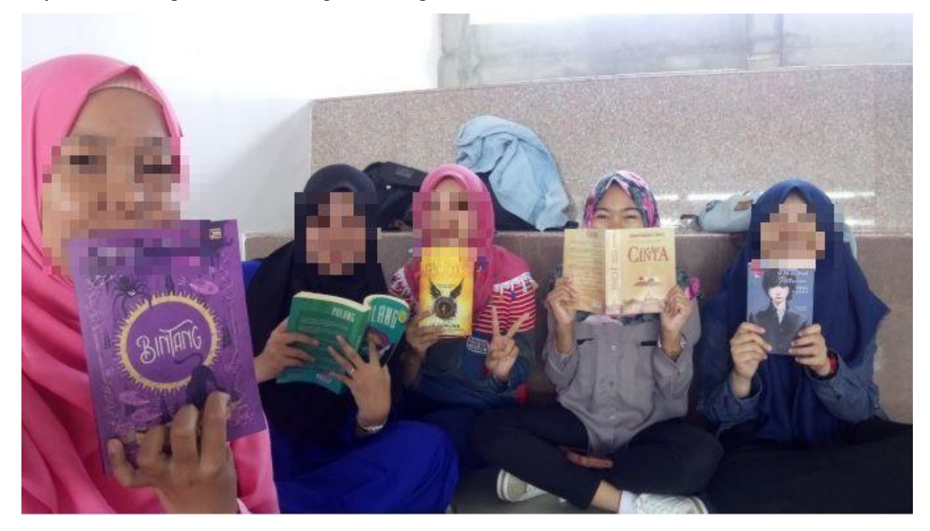
Picture 1. Students with their groups having a date to read their chosen book

exchanged information about pages they read. They also took a pic of them and the book then uploaded it in Schoology, one of learning management systems. The uploaded pic was completed with information of where and when they did the date and a caption of a favorite quote taken from the book read. Last but not least, they were provided with a reading log to fill after the date as a record of their individual reading performance. Information in the reading log was such as page numbers they finished in a week, their consistency of reading, and whether or not they have stealing time for reading excluding the dates with friends.