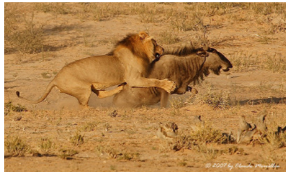
Figure 1. An actional image

ideational, interpersonal, and textual meaning (Halliday, 1994) in the verbal language exists in the visual images as well. Unsworth (2001) argue that visual images possess ideational/representation meaning in terms of informing what happened, who the participants are, what the roles of the participant are, and in what kind of circumstances the event take place in an image. The event in Figure 1 can show the visual representation of the participants: lion and wildebeest. The lion as a subject (an actor) makes a prey of a wildebeest as object (a goal).