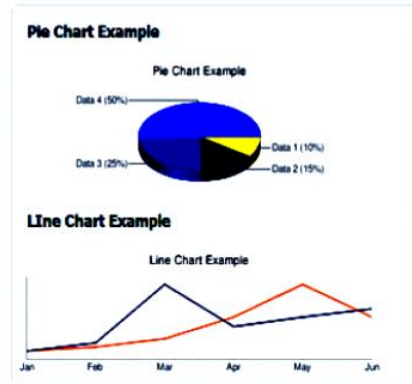
Figure 7. Arbitrary images

what way use them, what types of meaning are represented, and in what way the meanings are represented, it is not exaggerating that we may be included in the group of visually literate persons. At this stage, we might be able to use the skill in any purposes we involve like teaching English.