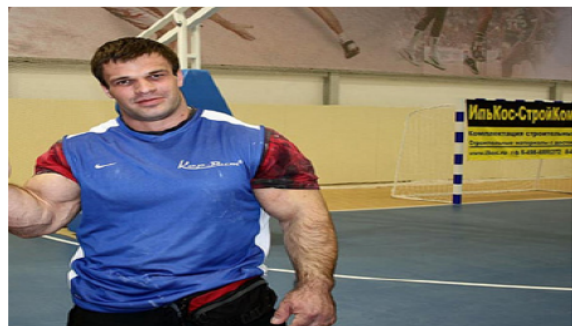
Figure 2. Regular guy vs. Russian arm wrestle Denis Cyplenkov

In terms of interpersonal/interactive meanings, visual images construct the interconnection features between speakers and listeners, writer and reader, and viewer and what is viewed. Figure 2 and 3 below denotes how the images demonstrate the interactive meaning between the viewer and what is viewed. In this case, the images share meaning to the viewers that Mr. Cyplenkov is powerful.