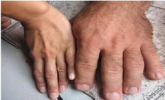
Figure 3. Female hand vs. Denis Cyplenkov's hand.

The textual/composition meaning also exists in the visual images in terms of the distribution of information value among the element of the images. Figure 4 highlights the role of interconnection of each element in the picture to build a whole rich visual context of words 'family reunion'. In fact, the figure provides an example of the new features in the second edition of Oxford picture dictionary.