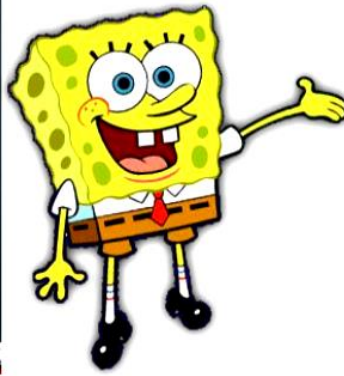
Figure 6. Analogical Images