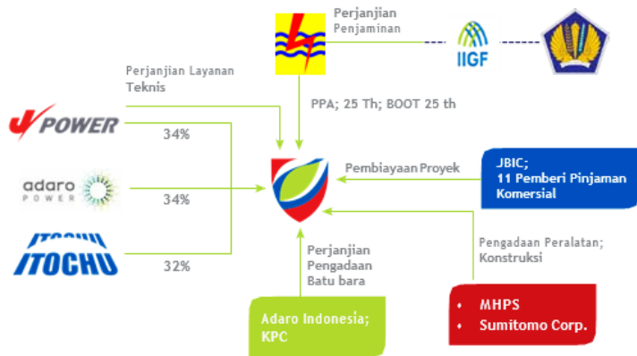
Graph 3.1. The Project Structure of Central Java Coal-Fired Power Plant 2x1000 MW