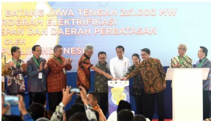
Picture 3.1 President Joko Widodo officially opened the construction of PT BPI