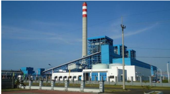
Picture 3.2 PT Bhimasena Power Indonesia in Batang Regency

Source: https://ekon.go.id/berita/view/pembangunan-proyek-pltu.633.html