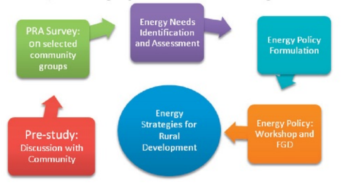
Fig. 1 Energy needs assessment and strategies using PRA method

communities, local stakeholders, local entrepreneurs and community groups. Information was collected during the survey (semi-structured interview) and focus group discussion on the following issues: