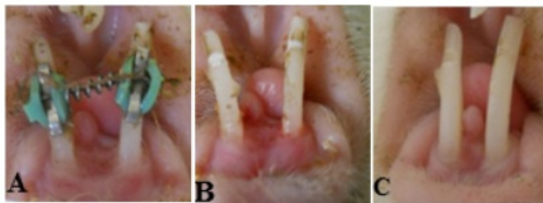
Figure 3. A) tooth movement was finished; B) bracket was removed; C) relapse on day 3.

contained in the gingival crevicular fluid were measured by using paper points on day 0 (A1), day 3 (A2), day 7 (A3), day 14 (A4) and day 21 (A5). Next, paper points were taken, and then the supernatant solution was stored at -80^{\circ}\text{C} for one week. 22 Examination of ALP activities was conducted at Laboratory of Molecular Biology, Faculty of Medicine, Universitas Gadjah Mada.