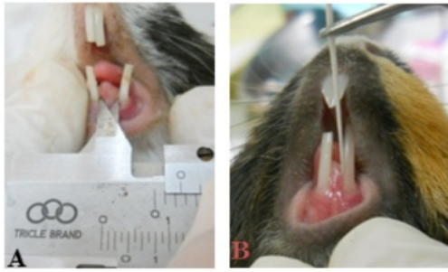
Figure 2. A) measuring the relapse distance using sliding caliper; B) taking gingival crevicular fluid using paper point.