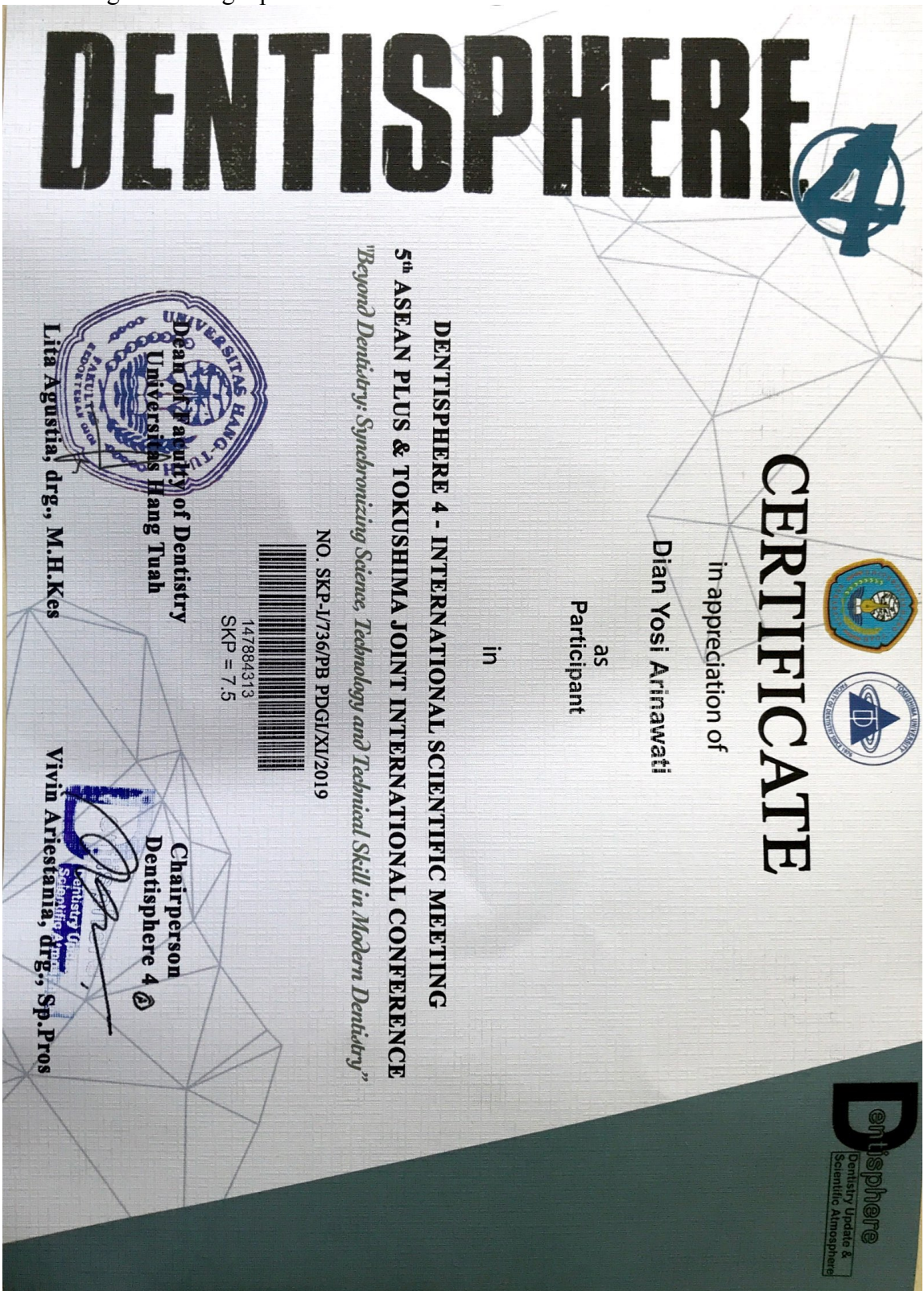
LAMPIRAN 3 Sertifikat kegiatan sebagai peserta