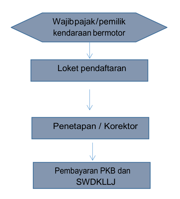
Image 3.1 Flow of System, Mechanism, and Procedure for Payment of 1 Year Taxes