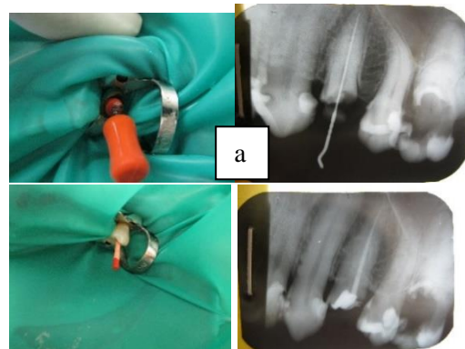
Figure 2. Root canal treatment, (a) preparation and (b) obturation

canals were flooded with chlorhexidine gluconate 2% for 30 seconds, and then obturation was performed using a single cone technique with F2 size gutta-percha protaper with resin sealer (top seal, Dentsply). The evaluation was carried out for one week before post-placement and final restoration.