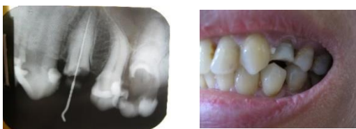
Figure 1. Intraoral radiograph and initial radiograph

A 42-year-old woman came to the dental conservation clinic at Prof. Soedomo Dental and Oral Hospital with complaints that her upper left and back teeth had been broken and swollen three years ago, but currently, the tooth did not hurt. On clinical examination, the remaining 24 teeth were minimal, only less than 1/3 of the incisal height; the percussion, palpation, and mobility examinations showed a negative response, and a vitality test uncovered a negative response. The radiograph showed a narrow straight root canal with a thickened periodontal ligament at the apical 1/3. The diagnosis was 24 tooth pulp necrosis accompanied by apical periodontitis. The treatment performed was a multi-visit root canal followed by restoration of a porcelain fused metal jacket crown with intracanal retention of radix anchor metal pins.