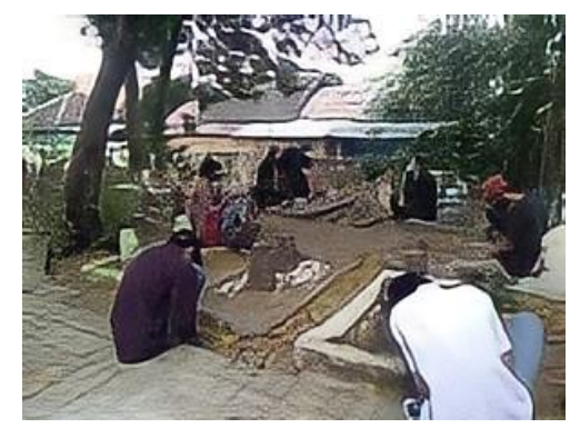
Figure 3 Muhasabah Life after Death