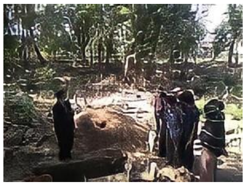
Figure 4 Stages of Inviting Students to the grave