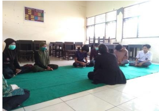
Figure 5 Guidance and Counseling