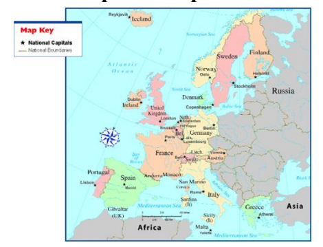
Figure 2.1 Maps of France<sup>7</sup>