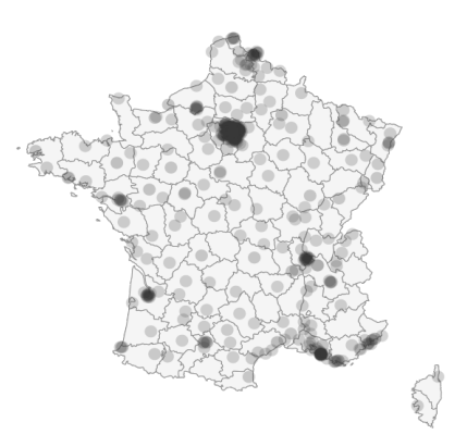
Figure 2.4 France Population Densities<sup>17</sup>

Even though France famous as secular countries with no religion attributes on their politics, 64 percent of