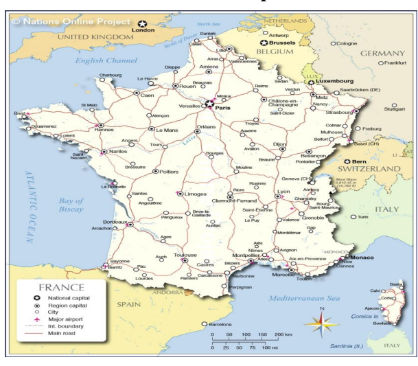
Figure 2.2 France maps<sup>8</sup>

The area of France is covered around 650, 000 km<sup>2</sup> and positioned as the largest country in European Union and rank