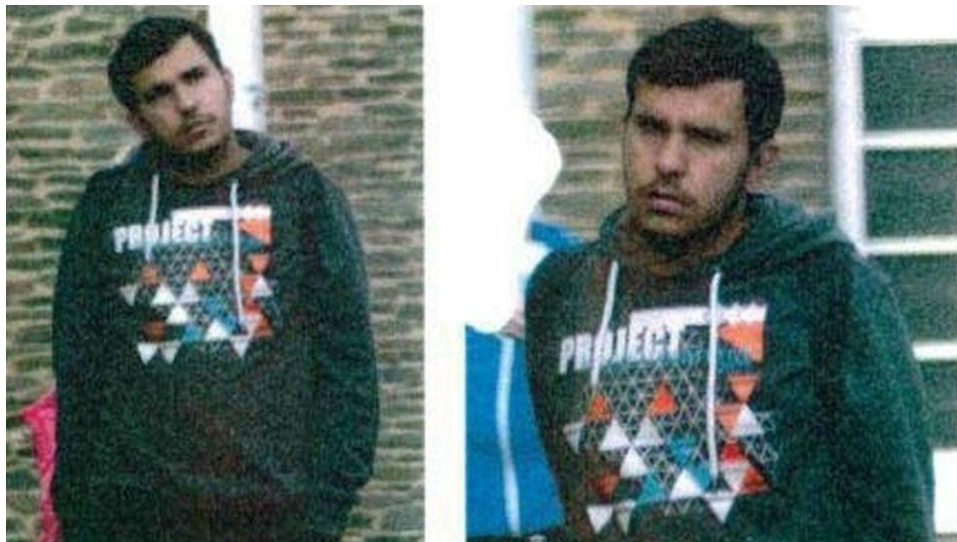
Figure 4.2 The Picture of Jaber al-Bakr

Picture of: Jaber al-Bakr, Sources BBC News, “Syrian Terror Suspect Jaber al-Bakr Found Dead in Cell in Germany”, available at http://www.bbc.com/news/world-europe-37638631 , accessed on Tuesday, December 5, 2016, at 9.32 pm.